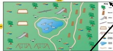
A map of the park

By the end of this unit we will be able to: