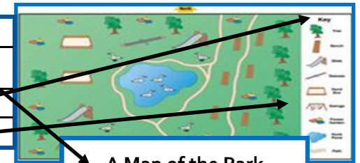
A Map of the Park

By the end of this unit we will be able to: